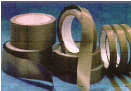
Nanking Conductive Fabric Tape Mil-Std 285 Modified