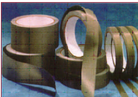
UltraFlex Conductive Fabric Tape Mil-Std 285 Modified